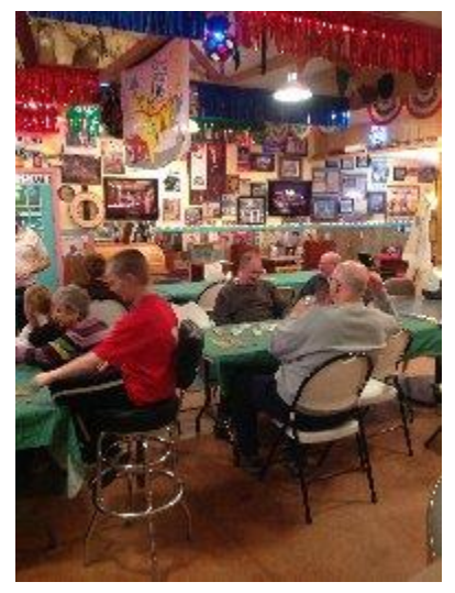
Having a good time