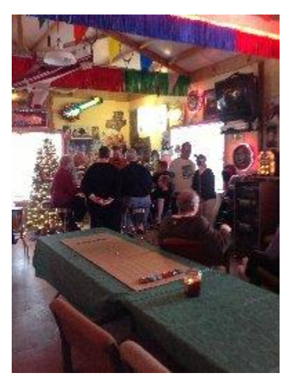
The Race car game