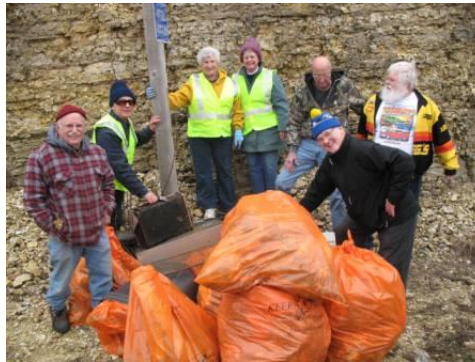
Highway Clean Up 4/15/2013

Page 1.....Editor's Note/Club Meetings/For sale Page 2.....From The Cooks/ Club Get-togethers/notes Page 3/4.....Secretary Noted Page 5.....Let The Season Begin Page 6.....Spring Banquet Page 7.....Calendar